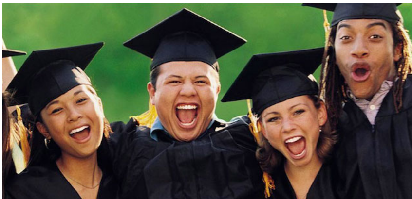
Look - Grads who just found out they received a memorial brick! ;)

Hint: this is a great way to honor your Class of 2015 Grad!!!!