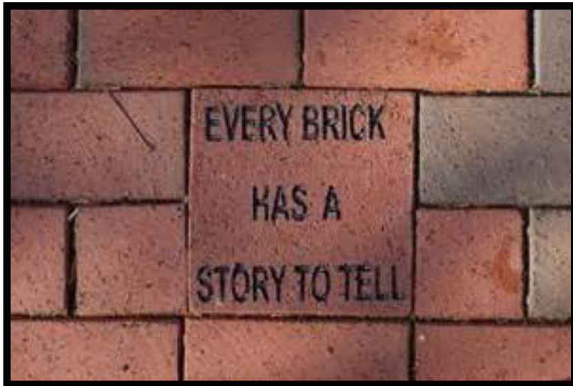
Bricks on located at the front of the high school near the flag pole.

Looking for a great gift for that special someone and can't think of what to buy? Consider a memorial brick!