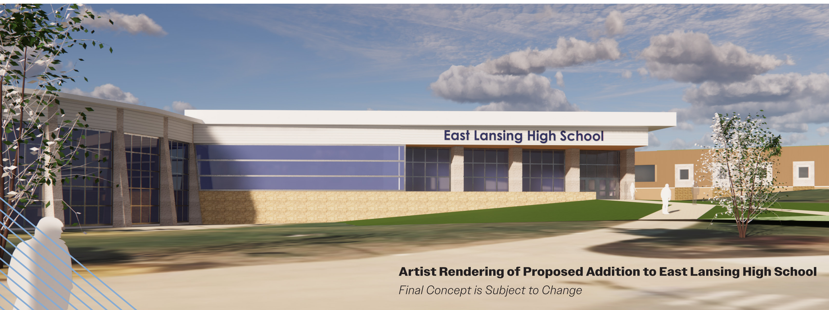
Artist Rendering of Proposed Addition to East Lansing High School Final Concept is Subject to Change

Follow the QR code with your phone camera to access the bond informational website